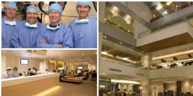
The new Bumrungrad International Clinic is the largest private outpatient clinic in the world. It will double our capacity to over 6,000 patients per day.

Bumrungrad serves an average of 3,000 patients per day. Some 1,200 per day are internationals. The average waiting time to see a doctor is under 30 minutes.